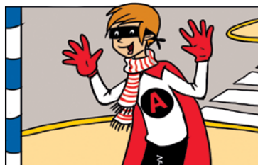
Two hours ago