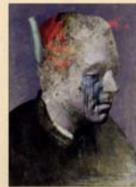
Eyemazing Editions Isabelle Cochereau 140-145