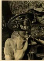
Eyemazing Editions Joseph Mills 18-31