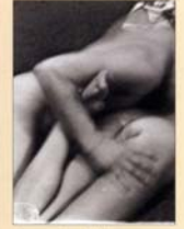
Eyemazing Editions Roman Pyatkovka 98-109