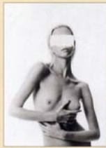
Exhibition Maxwell Snow 162-167