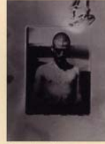
Eyemazing Editions Susu Laroche 92-97