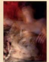
Eyemazing Editions Hector Olguin 146-153