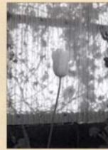
Publication Shidomoto Youichi 176-185