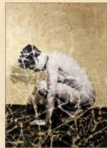
Gallery Ossip 132-139