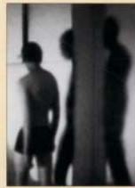
Eyemazing Editions Gonzalo Bénard 168-175