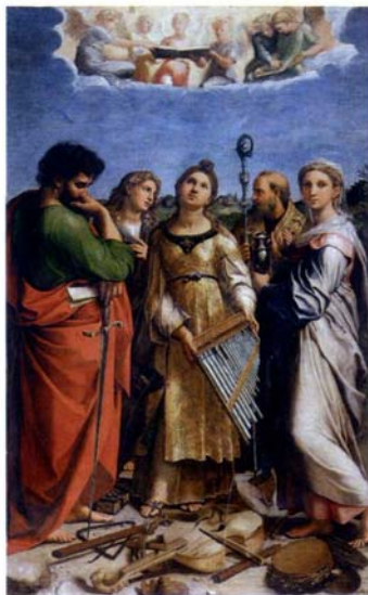
Rafael: Santa Cecilia, c. 1515-16. Óleo sobre tabla transferido a lienzo, 236 x 149 cm. Pinacoteca Nazionale, Bolonia.

La editorial Arte y parte, a los efectos previstos en el artículo 32.1. párrafo segundo del vigente TRLPI, se opone expresamente a que cualquiera de las páginas de Arte y parte, o partes de ellas, sean utilizadas para la realización de resúmenes de prensa.