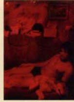
Eyemazing Editions Sergei Bykov 80-91