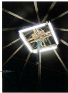
Four neon lights illuminating the artists' tent at Occupy Amsterdam, camp at Beursplein, Amsterdam, 2011.