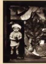
Eyemazing Editions Vyacheslav Baranov 40-49