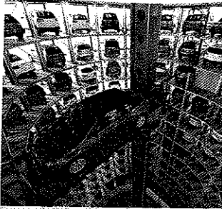
Volkswagen Germany's biggest carmaker is zooming towards world domination, page 56