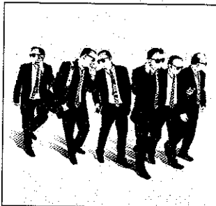
Banksters How Britain's rate-fixing scandal might spread, and what to do about it: leader, page 14. A "tobacco moment" for global finances, pages 23-25. Barclays and its regulators struggle to defend their reputations, page 26. The simple, misguided pleasures of banker-bashing: Bagehot, page 34. Reviews of books on capitalism, investing, hedge funds, Eli Broad and Terry Leahy, pages 73-75