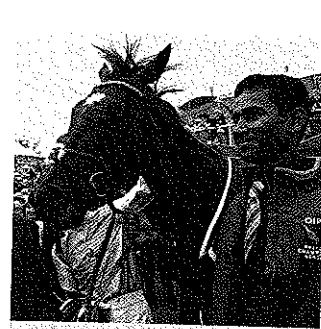
£100m racehorse Horseracing is shifting to Asia. Traditionally strong countries, such as Britain, may struggle, page 60