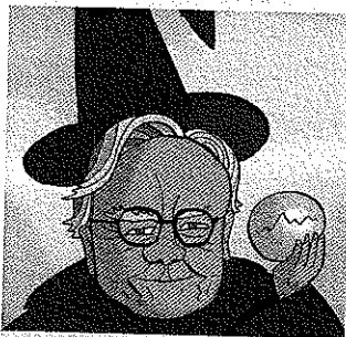
Warren Buffett Beating the market with beta: Buttonwood, page 71