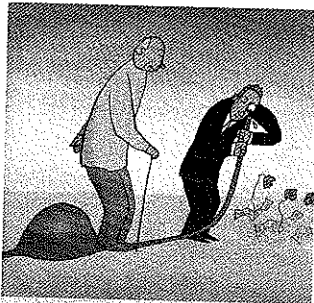
Sponging boomers The economic legacy left by the baby-boomers is leading to a battle between the generations, page 69