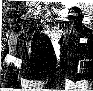
News Corp on a high The Murdochs' scandal-plagued media company has proved surprisingly resilient, page 62