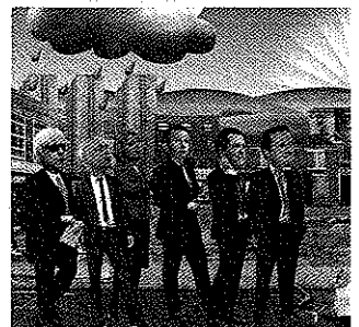
Cameron The prime minister lays out a strong electoral hand; maybe not a winning one: Bagehot, page 32. The Daily Mail has done Ed Miliband a favour, page 31