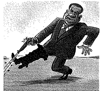
Berlusconi He miscalculated badly with his threat to bring down the government of Enrico Letta, page 25. Italy's turmoil shows the danger, and necessity, of national politics: Charlemagne, page 29