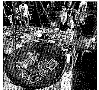
Abenomics Shinzo Abe is right to raise the consumption tax, but must do more to boost Japan's growth: leader, page 12. How Abenomics is working, page 46