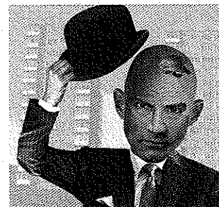
Britain's angry white men A far-right outfit is dying. The views it holds dear are not: Bagehot, page 34