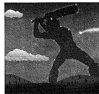
Sachin Tendulkar The impending retirement of India's cricketing genius demands national introspection: Banyan, page 52