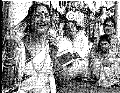
83 Indian mothers-in-law Curse of the mummyji

Subscription for 1 year (51 issues) Print only UK - £126