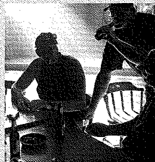
69 A tale of two rushes There's gold in them there wells