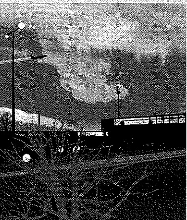
56 French culture Bleak chic