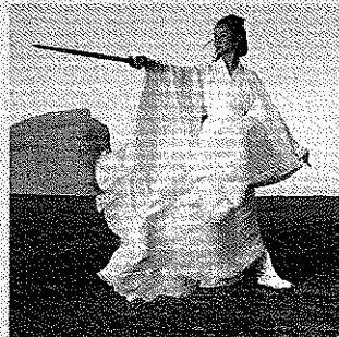
100 China's film industry The red carpet