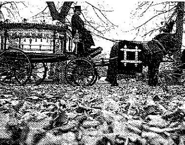
30 Cockney funerals Buried like kings