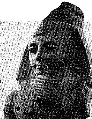
119 The real Ozymandias King of Kings