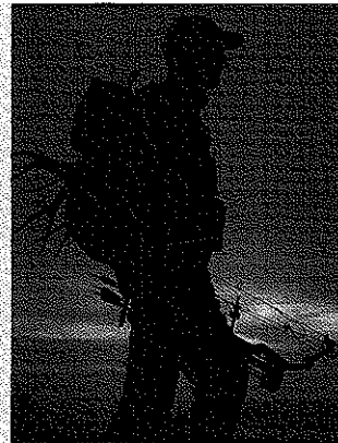
66 Bowhunting in America In a dark wood