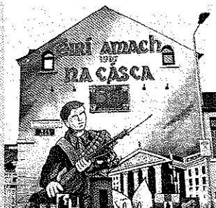
47 Speaking Irish in Belfast In the trenches of a language war