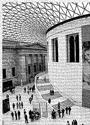
A special report on museums After page 68