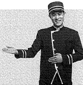
97 A short history of hotels Be my guest