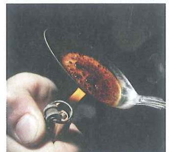
America's heroin relapse An old sickness has returned to haunt a new generation, page 39