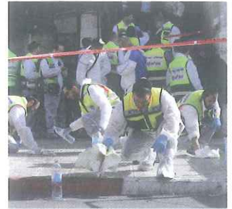
Jerusalem The Israeli-Palestinian conflict is drifting dangerously towards religious war: leader, page 14. A deadly attack on Jews at prayer raises the stakes in an already turbulent city, page 35