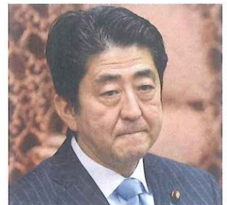
Japan's snap election Shinzo Abe has called a poll to consolidate power; voters should give him one more chance: leader, page 15. His big fight will be over economic reform, page 49