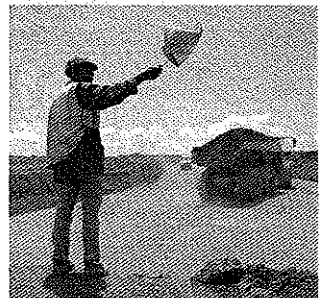
Commodities Why some commodity exporters are coping better with lower prices than others: leader, page 8. Africa's growth is being powered by things other than commodities, page 31