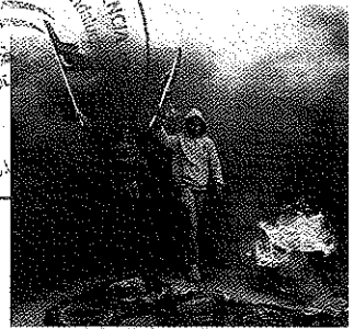
Libya Another font of global mayhem is emerging—not helped by Western indifference and meddling neighbours: leader, page 12. The four-year descent from Arab spring to factional chaos, pages 19-22