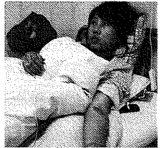
China Targets encourage officials to abuse citizens. Making government accountable to people would work better: leader, page 9. Enforcers of China's one-child policy are trying a new, gentler approach, page 49