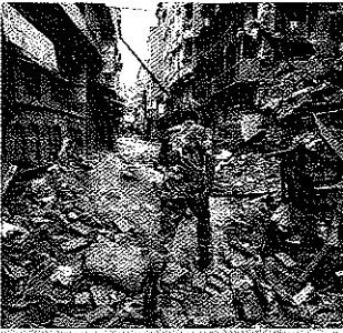
Earthquake in Nepal A 7.8-magnitude earthquake brings tragedy, and reveals political shortcomings, page 44