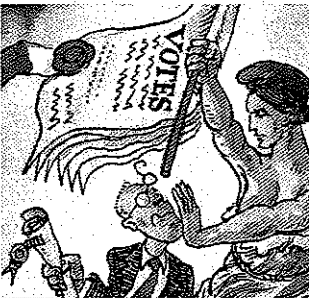
Shareholder rights in Europe Treating shareholders unequally will not help French firms conquer the world: leader, page 12. Multiple voting rights for loyal investors are increasingly touted as a way to make companies plan for the long term, page 56