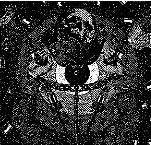
Drug war As one war on drugs ends, another is starting. It will be a failure, too: leader, page 10. One half of the world is softening its line against illegal drugs, but the other is getting tougher—and more vocal, page 51