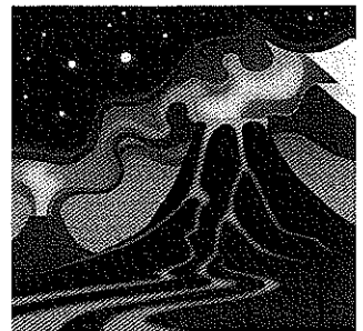
Science Experiment and contemplation have remade the world, but scientists are not finished yet: leader, page 12. In the first of six briefs looking at unsolved mysteries, we ask how life got going and whether it exists on other planets, pages 60-61. The race to crack the genetic code, page 63

REV. 150 CONSEJO DE ECONOMÍA, INNOVACIÓN Y CIENCIA Instituto de Estadística y Cartografía de Andalucía JUNIO DE 2015 20/18/15 C.I.F. B21507417