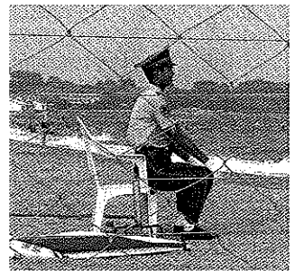
China The world should worry more about its politics than its economy: leader, page 10. The country's leaders take to the beach to ponder an unsettled outlook, page 41