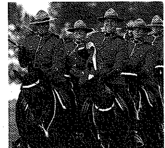
Canada It likes to think of itself as a global benefactor, but Canada has a mean streak, page 45