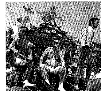
Yakuza Under pressure, Japan's biggest criminal gang has split. Prepare for a fight, page 50