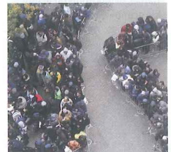
Migrants Angela Merkel faces a backlash over asylum-seekers. She should hold firm: leader, page 15. After a historic embrace of refugees, German opinion is turning, page 29. Britain's home secretary lashes out, page 36. Turkey's president once visited Brussels begging for favours. The tables have turned: Charlemagne, page 33