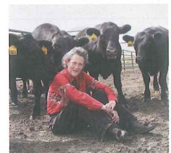
Slaughterhouses How Temple Grandin's designs have reformed America's meat industry, page 46