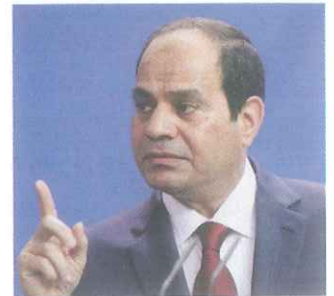
Sisi Egypt's president is taking his country down a dead end: leader, page 14. The sad state of Egypt's liberals, page 39