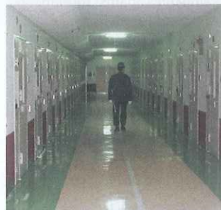
Japanese prisons Suspects in police cells are too vulnerable to abuse: leader, page 16. An over reliance on confessions is undermining faith in the courts, page 46. Why you might prefer a Thai jail to one in Japan, page 47