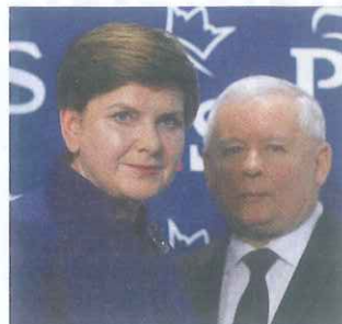
Poland The new government has made an awful start: leader, page 14. Why it un-nerves Europe, page 25