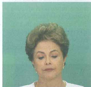
Brazil A flawed impeachment against Dilma Rousseff risks prolonging the country's agony: leader, page 14. The proceedings may mean that she is more, not less, likely to remain president until 2018, page 43