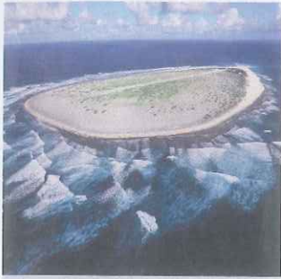
88 Shipwrecked in the Indian Ocean