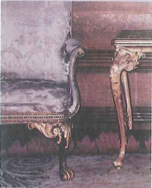
95 The declining appeal of antiques