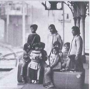
101 Global Gujaratis