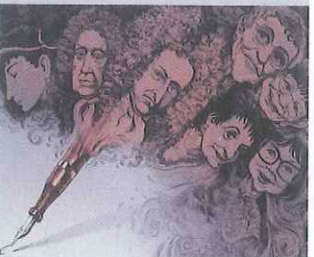
114 Agony aunts through the ages