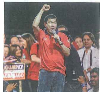
Philippines Will the next president, Rodrigo Duterte, revert to bad old ways? Leader, page 8. A strongman may prevent a rising economic star from realising its potential, pages 14-16