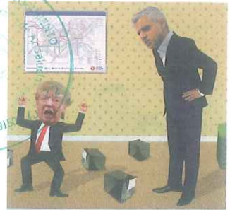
London's Muslim mayor Sadiq Khan won thanks to something even more powerful than populism—equanimity: Bagehot, page 24