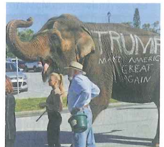
Republicans The party is in turmoil over Donald Trump, page 30. What small-business owners may wish to know about the likely Republican nominee, page 32. Heard on the trail, page 32