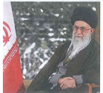
Iran It says the West is not honouring its side of the nuclear deal. Poppycock: leader, page 11. The agreement to curb Iran's nuclear activities may be more fragile than it seems, page 26