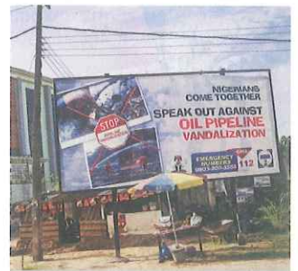
Niger Delta Avengers Nigeria's turbulent oilfields cannot be pacified by bribing rebels: leader, page 12. Violence in the Delta has cut oil output by a third. It may get even worse, page 29