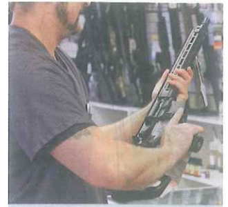
Gun control in America The impasse on restricting guns will not last forever: leader, page 10. Beyond the farrago in Congress there are reasons for hope, page 32