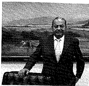
Carlos Slim and Televisa Mexico suffers from two near-monopolies: one in telecoms, the other in television. It should let them fight each other, page 52