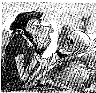
Humans and apes Studies of brain genetics are starting to reveal what makes us different, page 65