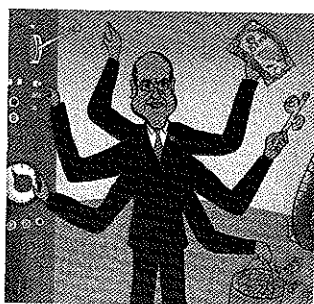
India's central bank One of the country's best institutions is also complicit in a government borrowing binge, page 58. A rash of state elections has national bearing, page 45