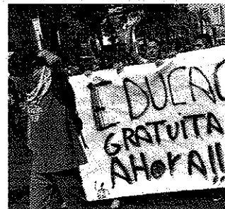
Protests in Chile How to stop a middle-class revolt from derailing a successful development model: leader, page 16. Politicians struggle to respond to the student rebellion, page 47. How Chile turned away from dictatorship, page 77