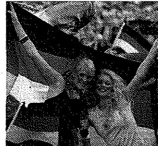
The German model The lessons the rest of the world should—and should not—take from it: leader, page 15. Germany's way of doing things is a lot less amenable to export than the wares it produces, pages 26–28