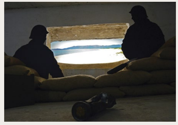
↑ Interior of the bunker.

The third room has been stripped of its military character and displays socio-cultural aspects of post-war Spain, with graphic resources and sound effects from a vintage radio.