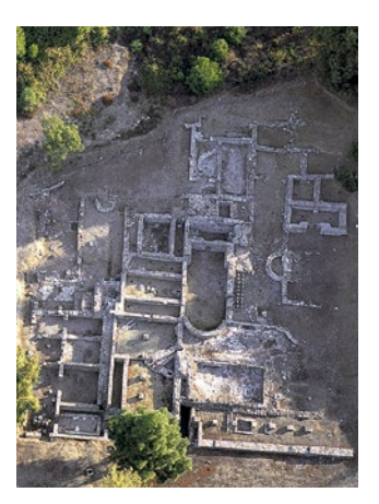
↑ Aerial view of the archaeological remains of the Carteia thermal building.

Here you can see the one known as the Rocadillo Domus , with similar construction techniques and structural characteristics to the dwelling next to the temple. Located at