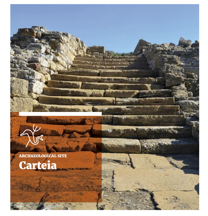
↑ Monumental staircase from the Augustan period (1st century A.D.).