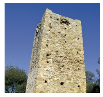
♠ Rocadillo Tower.

the crossroads of two paved streets, access was by means of two steps leading up from the street. It is a domus -type dwelling, with numerous rooms, an atrium with a cistern and a peristyle paved with mosaic. Sections of the Roman road can still be deen next to it.