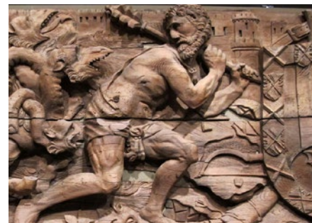
↑ Detail of La Hidra de Lerna on one of the palace's friezes. PARIS MUSEUM OF DECORATIVE ARTS.

On the second floor of the castle's East wing is a covered