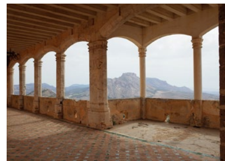
↑ East wing gallery with views across the meadows of Vélez Blanco.

gallery with six arches that looks out to, on the one side the Patio de Honor and on the other, the town and meadows of Vélez Blanco, which enabled the most private aspects of palace life to be enjoyed while also connecting with the castle's exteriors.