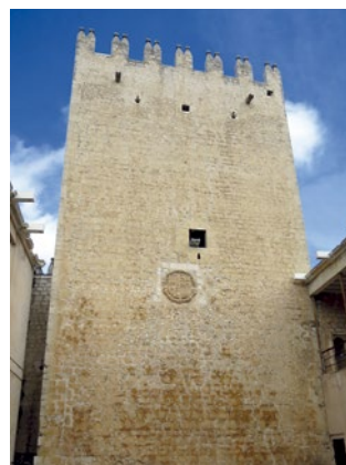
↑ Homage Tower with the Fajardo coat of arms.

The castle's main rooms, known as Triunfo (Triumph) and Mitología (Mythology) halls, were decorated with wooden friezes, on which The Triumphs of Cesar were represented in bas-relief, based on the paintings of Andrea Mantegna and The Twelve Labours of Hercules , inspired by the engravings of Giovanni Andrea Valvassori.