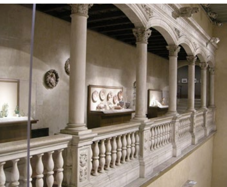
↑ Upper floor of the castle's Patio de Honor.

Of all the castle's spaces, the one that best represented the decorative type of building, was the Patio de Honor. This patio was decorated in white Macael marble and could be found on pillars, arches, balustrades and door and window frames, reflecting the refinement of the first Italian Renaissance of the end of the 15th and the beginning of the 16th century. It has an elongated layout, measuring 16 x 13 metres, with a lateral bend entrance. The South