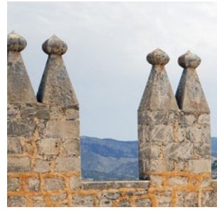
← Merlons topped with double pinnacles crowned with pike shaped motifs.

During the 18th century, although it still retained a large part of its decorative opulence and represented a symbol of territorial power, the use of its materials in other buildings such as the church in Vélez Rubio was allowed, reusing the bronze cannons as bells and the ancient lead roofing. This destruction would be accentuated with the French invasion and the War of Independence. From then on, it would be subjected to all forms of pillaging and looting; the interior layout was altered and it was used as a home by vagrants.