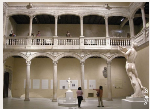
↑ Castle Patio in the Metropolitan Museum in New York.

In 1982, works resumed, however, the restoration lines that had been followed until then changed. During the initial phase, work was carried out on the Keep ( Torre del Homenaje ) and ancillary buildings and during the second phase, between 1994 and 1998, work was carried out on the courtyard known as the Patio de Honor . The aim of this second phase was to enable the castle to be used for tourism and cultural purposes and it included recovering the original volumes of the Patio and its adjoining rooms. The missing frameworks were reinstalled with a vertical structure with steel columns to serve as an anchoring point for the pieces that would be executed during future decoration phases. In 2005, the castle was acquired by the Regional Government of Andalusia and in 2008 the Patio was scanned in the Metropolitan Museum.