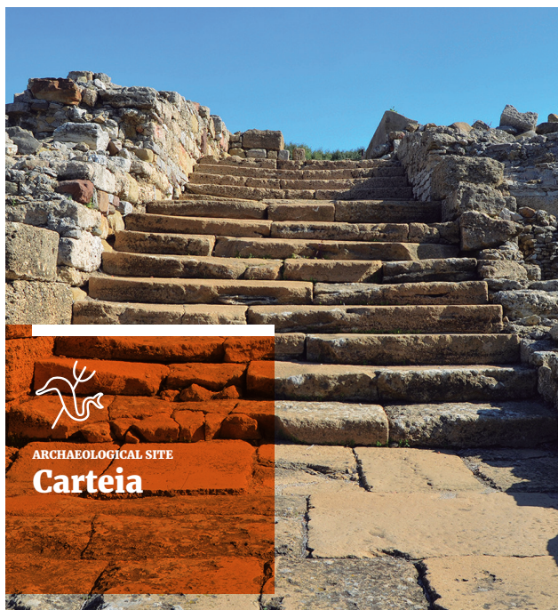
↑ Monumental staircase from the Augustan period (1st century A.D.).