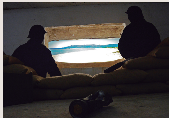
↑ Interior of the bunker.

The third room has been stripped of its military character and displays socio-cultural aspects of post-war Spain, with graphic resources and sound effects from a vintage radio.