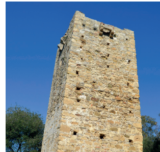
↑ Rocadillo Tower.

the crossroads of two paved streets, access was by means of two steps leading up from the street. It is a domus -type dwelling, with numerous rooms, an atrium with a cistern and a peristyle paved with mosaic. Sections of the Roman road can still be seen next to it.