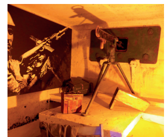
↑ Interior of a bunker room.

In this area you can also visit one of the bunkers built during World War II, which has been turned into a museum, being the first one of its kind in Andalusia.