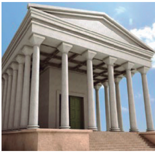
↑ Ideal reconstruction of the temple.

Over the remains of ancient religious constructions from the Punic period, a large temple was erected, the oldest known republican monument in this place (2nd century B.C.), with a surface area of 24 x 18 m. The temple stood on a 1.90 m high podium and was entered via a front staircase framed by two side blocks that protruded from the facade. It was possibly a hexastyle temple -with six columns at the front-, of the peripteral type, that is to say, surrounded by columns except at the rear. It had a cella that housed the statue of the god, whose identity is currently unknown.