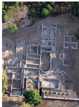
↑ Aerial view of the archaeological remains of the Carteia thermal building.

Here you can see the one known as the Rocadillo Domus , with similar construction techniques and structural characteristics to the dwelling next to the temple. Located at