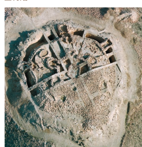
↑ Aerial view of Fort I.

The Site is surrounded by 13 forts located in the nearby mountains, each one with a unique structure. The Fort 1 has a complex structure with a two lines of circular walls around which 6 towers and bastions open to the exterior, as well as double concentric line of moats that surround said walls. This is interpreted as a place with strategic or military functions, or for visually inspecting the nearby natural passages. In its interior it houses an area of mills and storage pots and a small cistern between both lines of the wall. Furthermore the presence of an arrowhead carving workshop and numerous anthropomorphous bone and stone idols, poses the hypothesis that it involves a site related to learning and symbolic activities and rituals from different members of the settlement.