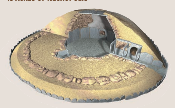
↑ Isometric elevation of one of the tholos of the site.

The necropolis of Los Millares is made up of some 80 tombs, distributed in small groups, of large dimensions and diverse structures of a ceremonial nature.