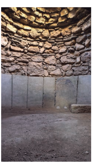
↑ Circular chamber of Tomb I.

From here we continue towards Wall II, formed by a very wide wall and diverse reinforcements that close a more internal perimeter of the plateau. It has an access in the central part, formed by a corridor protected by two towers on the sides 53. Inside the walled area are large cabins, homes defined by mud rings and other circular structures interpreted as ovens.