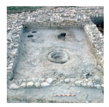
↑ Metalworking workshop.

The plateau is closed forming a space on which is located one of the most outstanding places such as the metalworking workshop with a square floor with a furnace dug in the ground with mud rings and a grave where elements of smelting slag appeared and an area paved with drops of copper mineral. On the highest area appears a building with a square floor, interpreted as a palace-store room or a temple 5.