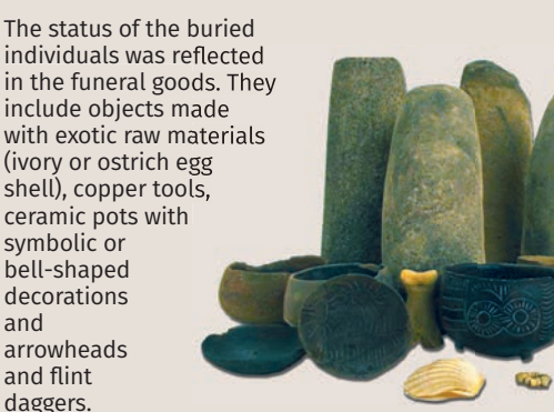
↑ Grave goods of tomb 15.

A maximum of 100 individuals are buried in each tomb and the niches were used for the burial of children. As the chamber and niches were occupied, the corpses were placed along the corridor.