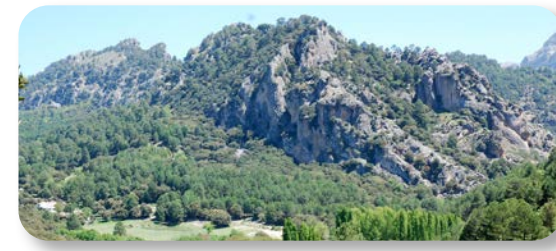
The River Guadalentín carves a great canyon at the foot of peaks of more than 2,000 metres

The descent now becomes steeper, and we will appreciate it a little more until we reach the Cortijo de la Pulera without taking any detour. From here we can find the forest house of Vado de las Carretas [4], the Caballo hill. The track reaches the river, in the spot known as Vado de las Carretas, a pleasant and paradisiacal place that is well worth a stop. We will have to ford the river and quickly turn left, to start climbing again if we want to finish the route in the area known as the Trinchera and thus contemplate the whole Guadalentín Canyon and especially the Puntal de Ana María.