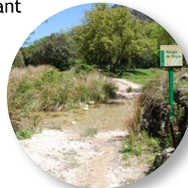
Views from the highest part of the route

The descent now becomes steeper, and we will appreciate it a little more until we reach the Cortijo de la Pulera without taking any detour. From here we can find the forest house of Vado de las Carretas [4], the Caballo hill. The track reaches the river, in the spot known as Vado de las Carretas, a pleasant and paradisiacal place that is well worth a stop. We will have to ford the river and quickly turn left, to start climbing again if we want to finish the route in the area known as the Trinchera and thus contemplate the whole Guadalentín Canyon and especially the Puntal de Ana María.