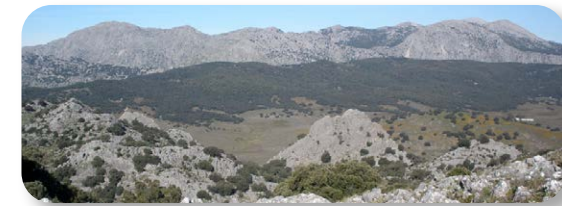
The views of the sierra are magnificent

From Llanos del Republicano, a trail rises through the Sierra de Libar and in about an hour takes us to Puerto del Correo. On the ascent we can enjoy not just the great views of the trail but the pavement formation through which the path winds [4]. We make our ascent along the saddle of the Tiro de la Barra and find ourselves the