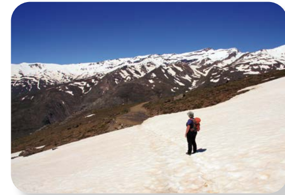
Hiker in the snow

particular if the snow is hard, surrounding them if necessary to prevent accidents.