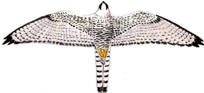
Peregrine Falcon Falco peregrinus - 110 cm