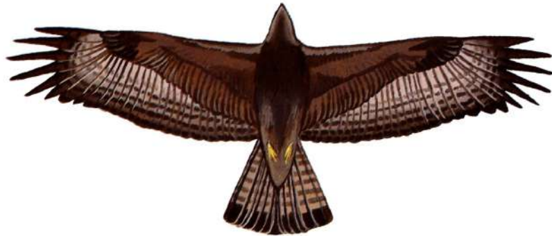
Golden Eagle Aquila chrysaetus - 227 cm