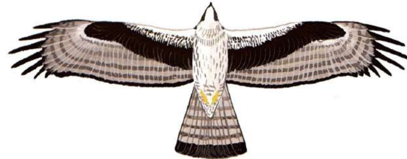
Bonelli's Eagle (Vulnerable Species) Hieraetus fasciatus - 180 cm