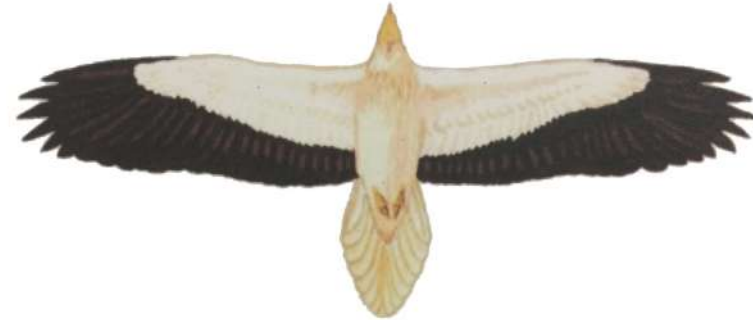
Egyptian Vulture (Endangered Species) Neophron percnopterus - 171 cm