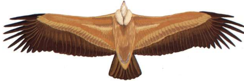
Griffon Vulture Gyps fulvus - 280 cm