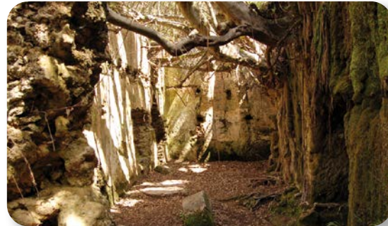
The Susto mill worked with the waters of the Arroyo del Descansadero, directed from a small lagoon crowned by an old fig tree.

Past the wall we cross a small stream if the current allows to reach the ruins of the old Susto mill [2]. Among the ruins and the surrounding green thicket, we can see the odd abandoned (mill)stone next to a waterfall, making for a charming, enchanting setting.