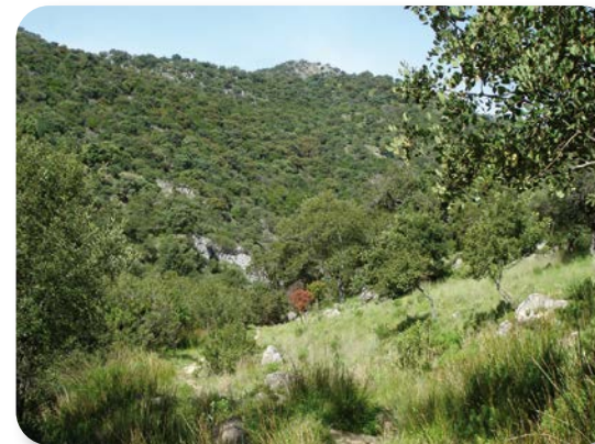
Among the vegetation we can see and hear the nightingales, common blackbirds, finches, long-tailed tits, European robins, hoopoes and, circling above us, griffon vultures, kites and eagles. There are also genets, mongoose and badgers.

The rushes and oleanders will guide us to a small fountain. This is the Descansadero fountain [4]. Leaving the fountain behind, we encounter the aroma of aromatic plants like lavender, thyme, camomile and oregano. We rise a number of steps lined with white poplars on both sides. On our right we see the remains of an old quarry, today sealed off. On our left there are also signs of the extraction of white sand from the terrain.