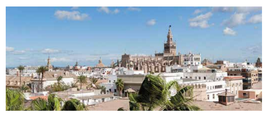
Panoramic view of Seville from the Schindler Tower.

the image of Seville projected through the arts, commemorative monuments, tourism and contemporary architecture, including the discourses and the evaluations of heritage protection policies and the press. Direct analysis, in this case, was confined to participant observation, surveys of key agents and the formal analysis of the city viewed statically and dynamically from a distance and at close range (Fernández-Baca, Fernández & Salmerón, 2015; 2017).