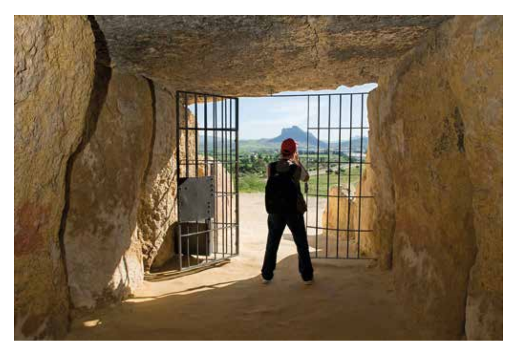
View from the Menga dolmen. Antequera Dolmen Archaeological Complex.

The Laboratory applied direct analysis in the study project on the landscape dimension of the Antequera Dolmens Archaeological Complex (Caballero et al., 2011; Durán, 2012). In this case, documentary sources were examined to discover the context and meaning of social discourses on the dolmens in the town of Antequera. a map of local agents was developed on a participatory basis, and participant observation, semi-structured and in-depth interviews and discussion groups were conducted. A technical assessment was also made of