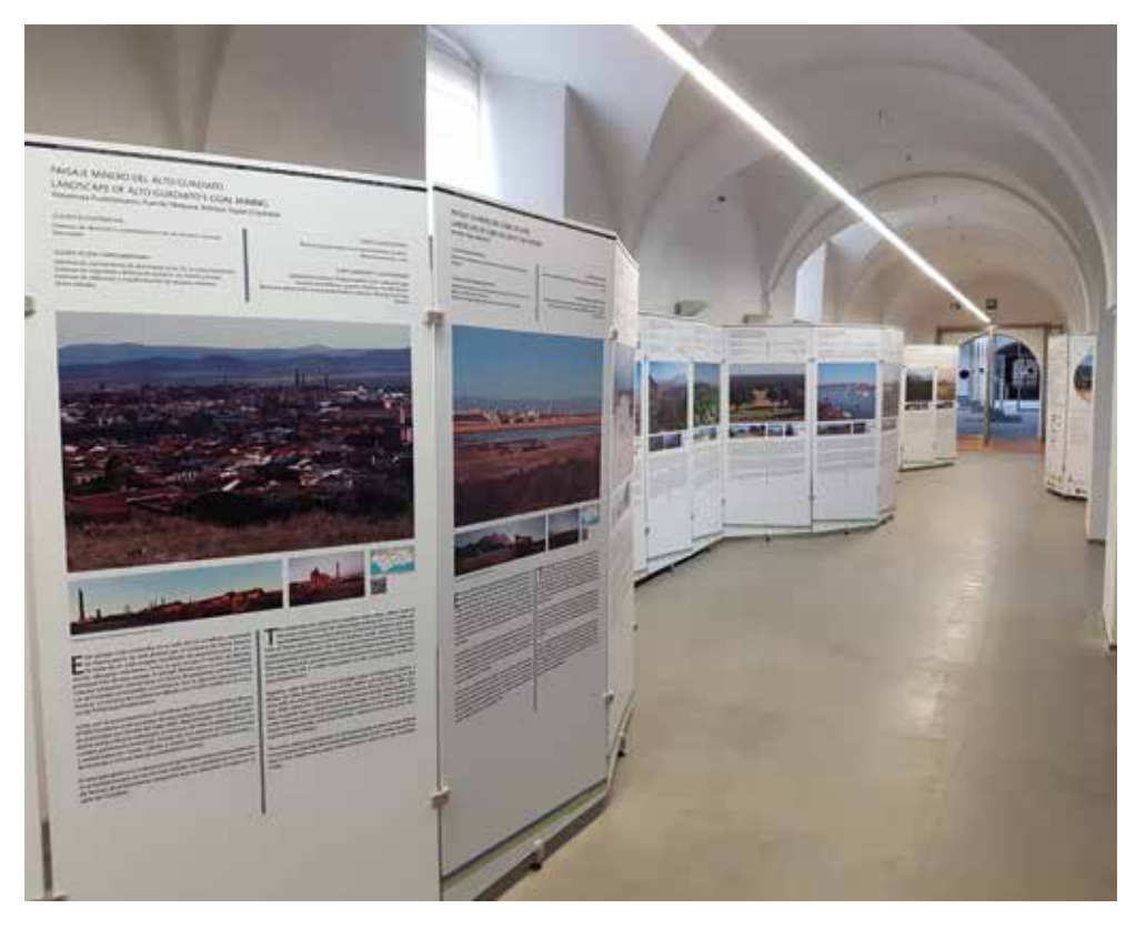
PAYSOC project exhibition.

Lastly, an on-site and virtual exhibition was also set up. The on-site exhibition ran at the IAPH from 15<sup>th</sup> January to 31<sup>st</sup> March 2021 and at the University of Seville School of Architecture from 4<sup>th</sup> to 29<sup>th</sup> April 2022. The virtual version was inaugurated on 8<sup>th</sup> June 2021 in the framework of the Landscape Archaeology Congress 2020+1, organised by the Centre for Human and Social Sciences of The Spanish National Research Council (CSIC)<sup>7</sup>.